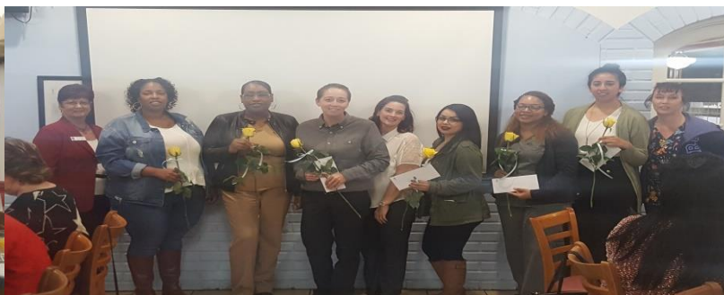
2018 Live Your Dream Award Recipients